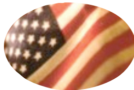
American Made Ergonomically Designed

Ask your Honsa® rep for information on anti-static mats, extruded mats by the foot, molded mats with antimicrobial, anti-slip mats 1/4" thick, and other products. Honsa® has the Comfort Mats for all your applications.